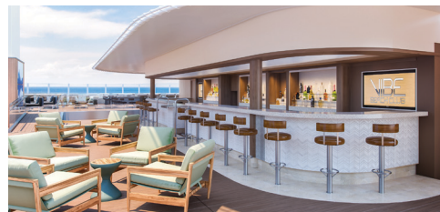
Vibe Beach Club

Exclusively for guests 18+, Vibe Beach Club is resplendent with ocean views, ideal for relaxation. A limited number of passes will be available for purchase at the Guest Service Desk. Seating capacity: 254