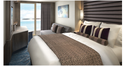
Mini-Suite with Balcony