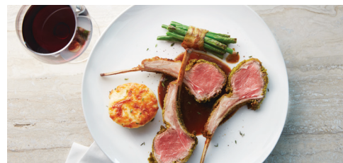
The Haven Restaurant