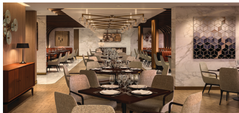
Onda by Scarpetta