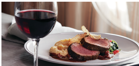
The Manhattan Room