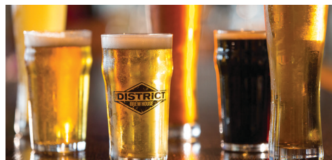
The District Brew House

Order one of more than 50 different bottled beers or any of the 22 draft beers on tap. Sip on a handcrafted specialty cocktail or sing alongside live music. Seating capacity: 94