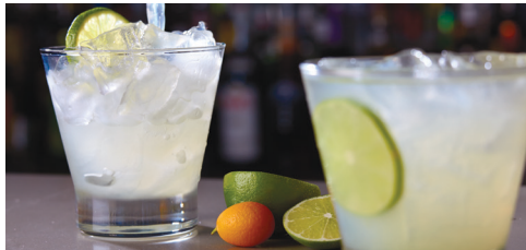
The A-List Bar