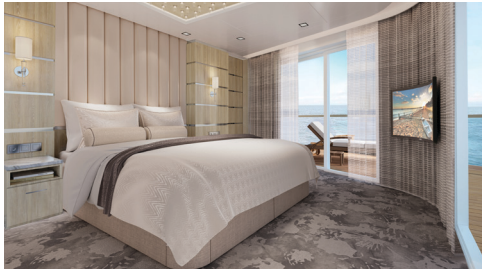
The Haven Deluxe Owner's Suite