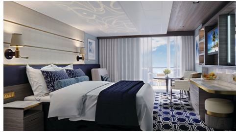
Courtyard Penthouse with Balcony